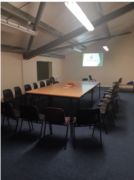
Our new meeting room at the practice

On Tuesday 29 th October we held the first meeting of our 'Beef Discussion Group'. This is the first part of what will become our Farm Club with Sheep and Dairy Discussion Groups to follow. The aim of the meeting was to encourage the vets and farmers to gather to share information and knowledge with the intention of helping everyone improve the profitability of their business.